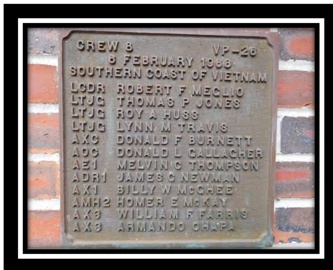
One of two plaques in the Memorial Garden dedicated to two VP-26 aircrews lost during combat operations of Vietnam; this one memorializes the loss of Crew 8 on February 6, 1968.

Today, the Museum's mission is to preserve the history of our maritime patrol aviation heritage. We also honor the tens of thousands of military and civilians who served at BNAS and contributed to our safety and freedom.