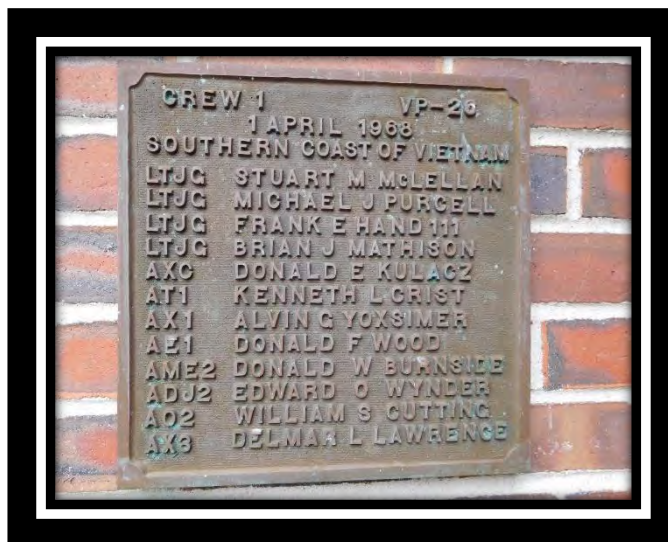
The second plaque is dedicated to VP-26 Crew 1, lost on April 1, 1968. The two crews will be remembered during the 50 th Anniversary celebration of the Memorial Garden.