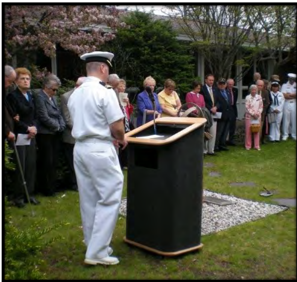
Photo taken in Memorial Garden during a commemorative service in May 2009.