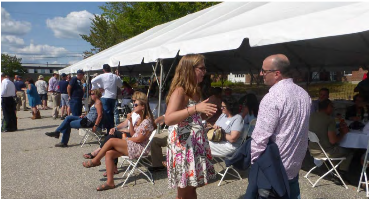
VP-92 Minutemen alumni, family, and friends enjoying the Great State of Maine Air Show.