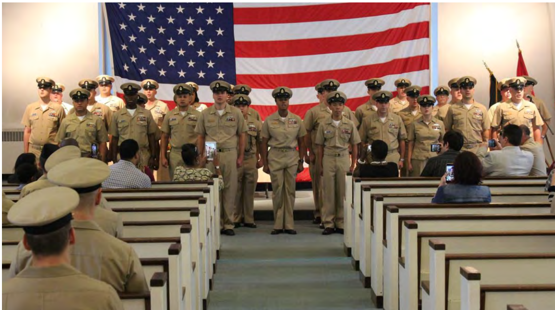
The Chief's Mess singing "Anchors Aweigh," led by the Navy's three newest Chiefs.