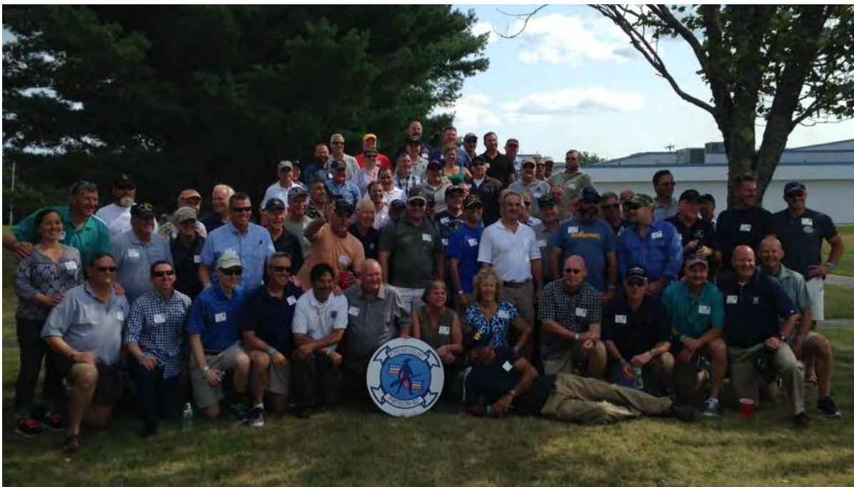
VP-92 Minutemen alumni enjoying their 10 th Annual Reunion.