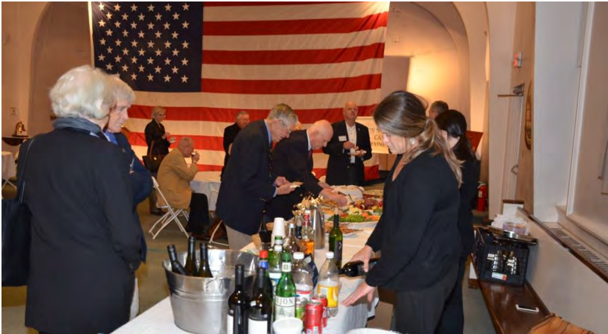
242 nd Navy Birthday Celebration attendees enjoying fine food and drink from Mae's Café.