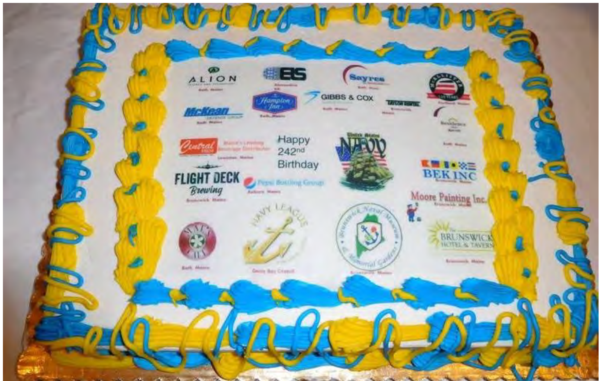
The Casco Bay Council of the Navy League and the Brunswick Naval Museum would like to thank each of the corporate sponsors of this great event!