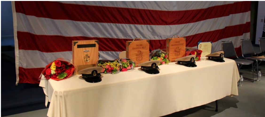
Chief Petty Officer khaki combination covers stand ready for presentation in front of the traditional "Charge Books" of the three selectees.