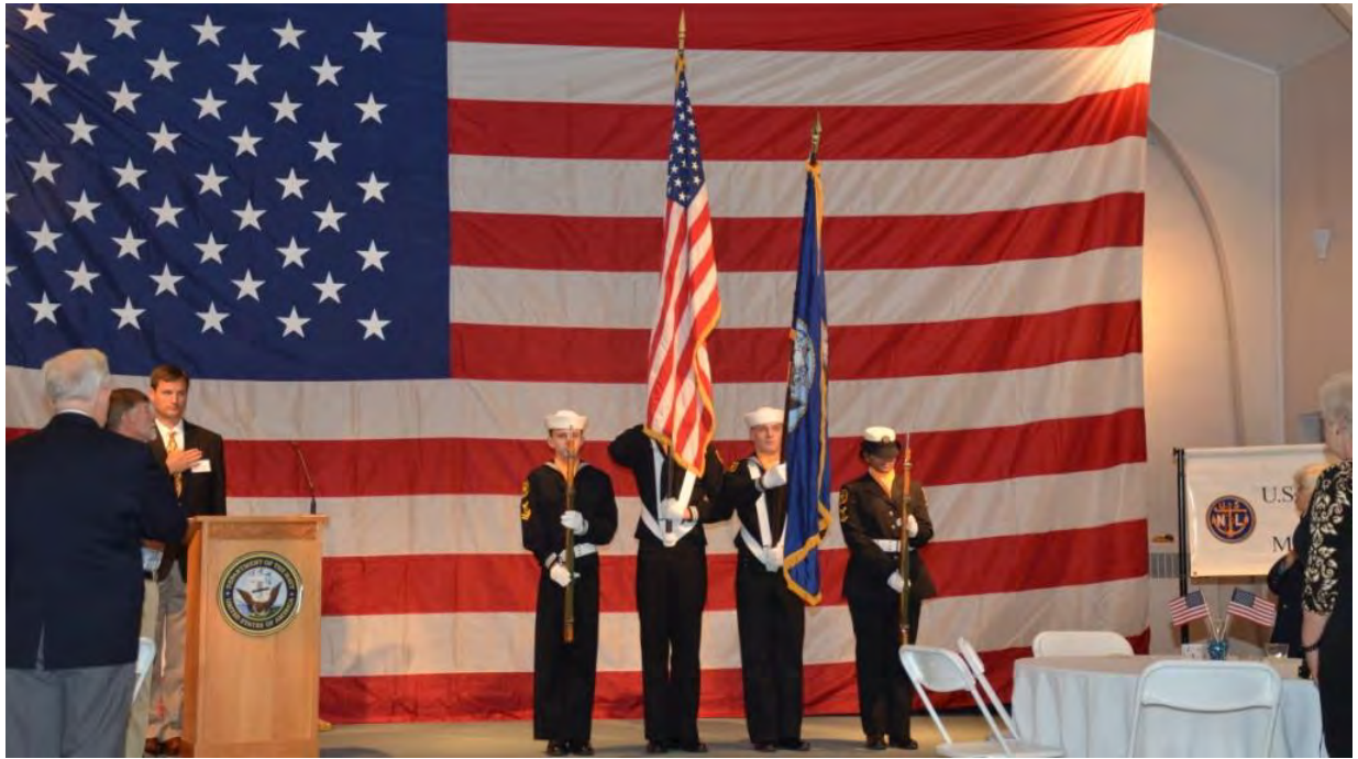
“Pride and Professionalism” on display, courtesy of the Sea Cadets of Coast Guard Division Portland.